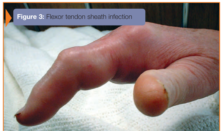
Figure 3: Flexor tendon sheath infection

straighten the finger (see Figure 3 ). This infection requires immediate surgical drainage of the tendon sheath and antibiotics.